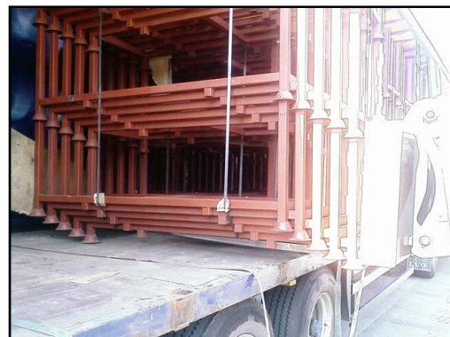
Unloading piles with tractor.