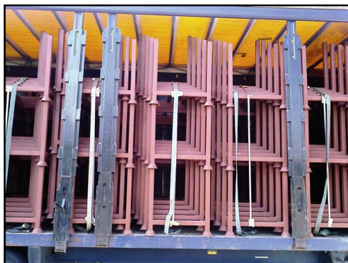
Loading piles on truck, with "straight" side towards loading side.